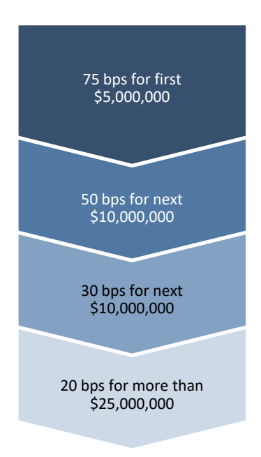
FIGURE 6 LARGER ASSET MANAGEMENT MANDATES OFFER ECONOMIES OF SCALE

One of the easiest examples to quantify economies of scale is the fee differential for larger versus smaller asset management mandates. Figure 6 presents a hypothetical tiered fee structure for a third-party long-only equity manager.